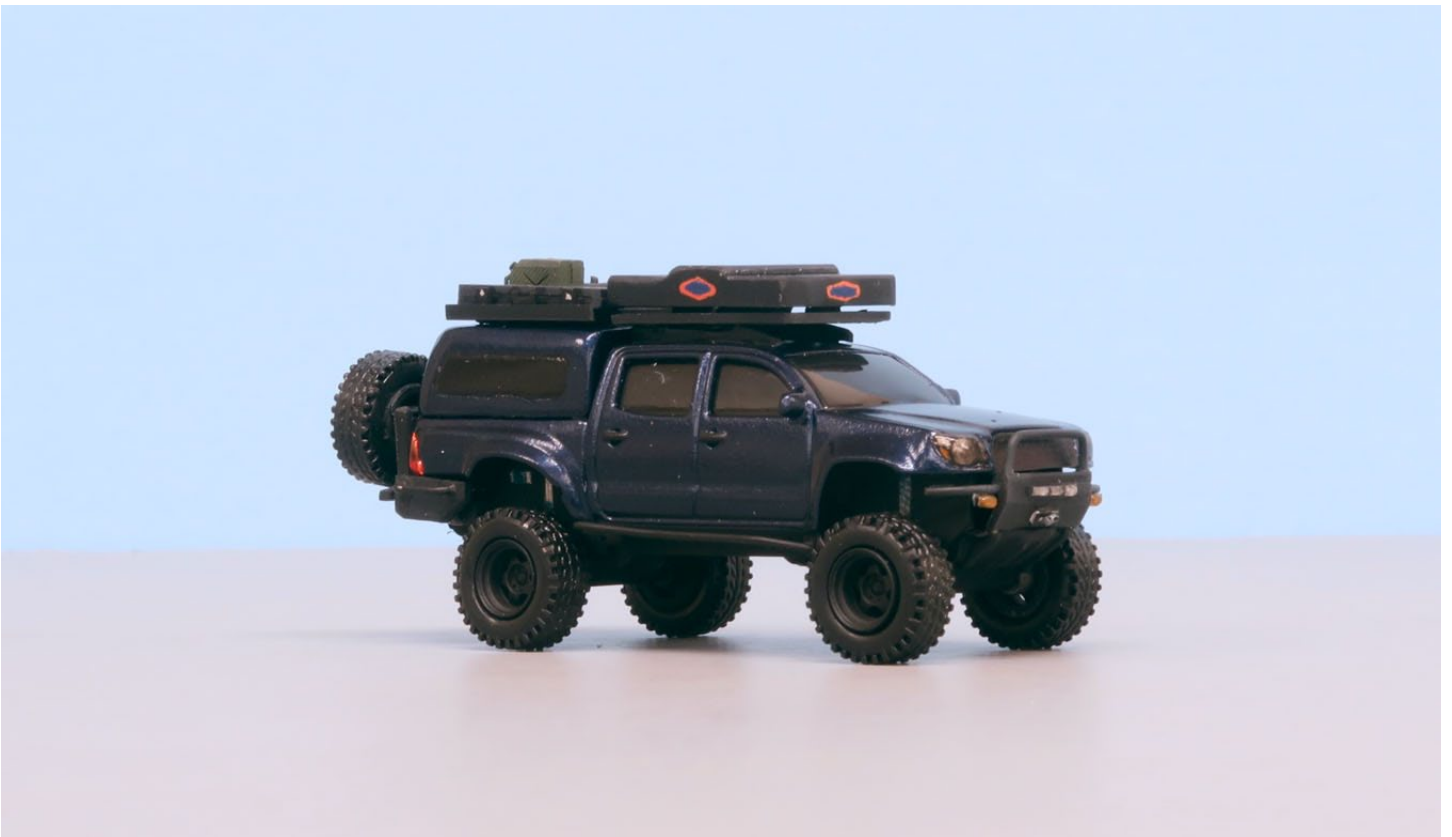
Jason Lee's 1:64 scale 2008 Toyota Tacoma (Matchbox), built to resemble the vehicle he actually owns. Extramarket items include bumpers, wheels and roof rack. The model is painted with automotive lacquer and Tamiya clear spray lacquer.